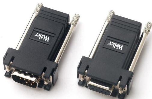
WX Adapter for PC Order No. 0058764711

Order No. 0052920999 (0052920899 for pencil only)