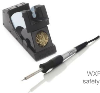
WXP 65 set with safety rest WDH 10