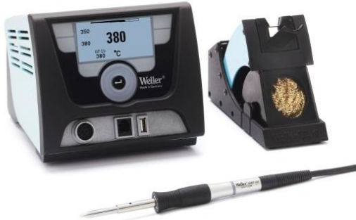
WX 1 control unit with WXP 120 (120 W / 24 V) soldering pencil and WDH 10 safety rest