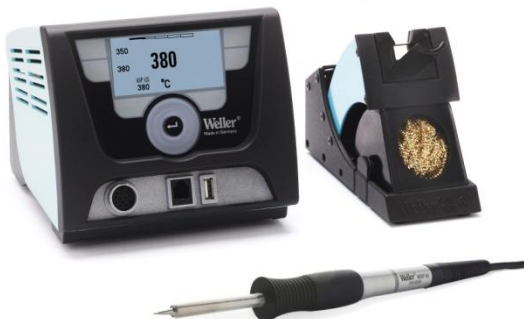
WX 1 control unit with WXP 65 soldering pencil (65W / 24V) and WDH 50 safety rest