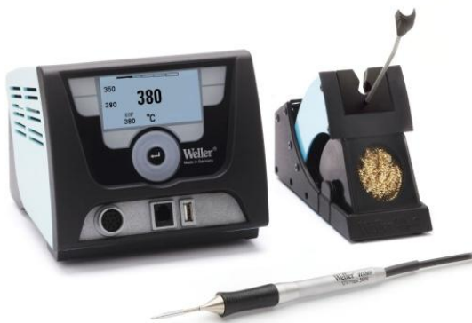
WX 1 control unit with WXMP Micro soldering pencil (40W / 12V) and WDH 50 safety rest