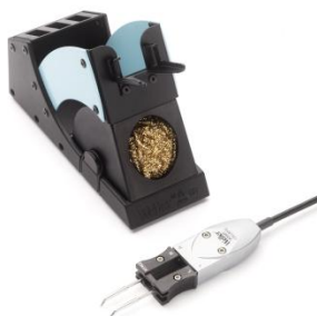
WXMT set with safety rest WDH 60

Order No. 0052920499 (0052920399 for pencil socket only)