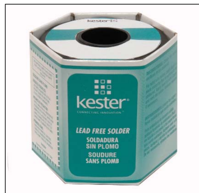
"275" No-Clean Core 1 lb. with K100LD