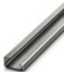
G-profile DIN rail, material: Steel, unperforated, height 15 mm, width 32 mm, length 2 m

DIN rail - NS 32 UNPERF 2000MM - 1201015