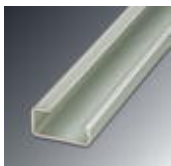
G rail 32 mm (NS 32)

DIN rail - NS 32 AL UNPERF 2000MM - 1201028