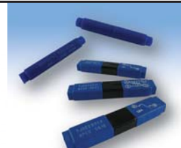
Single In-Line Splices Dual In-Line Splices Electronic Splices