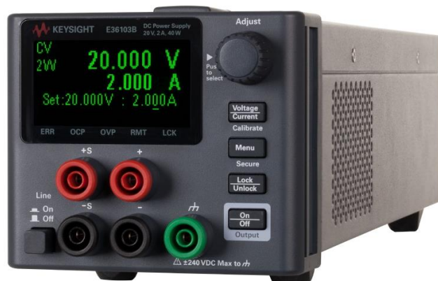
Option J01 recessed binding posts

Do you need to convert the power supply for different mains power? The two switches on the bottom of the instrument make it straightforward. See the product manual for details.