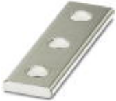
Connection rail, Color: silver