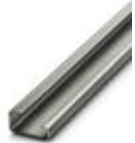
G-profile DIN rail, material: Steel, unperforated, height 15 mm, width 32 mm, length 2 m

DIN rail - NS 32 UNPERF 2000MM - 1201015