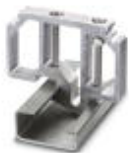
End clamp, for end support of UKH 50 - UKH 240, is pushed onto DIN rail NS 32 and fixed with 2 screws, width: 10 mm, color: Aluminum