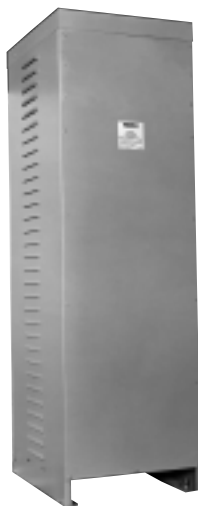
5000/6000 Series Enclosed Unit