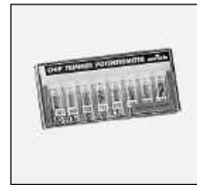
D. 5x2x3/4 Hard Plastic Box