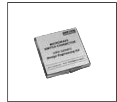
E. 4-3/4x4-3/4x3/4 Hard Plastic Box