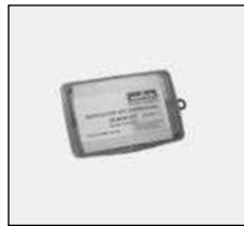
C. Soft Plastic Case