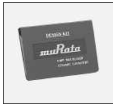
A. 7-3/4x5 Blue Binder with Sleeves