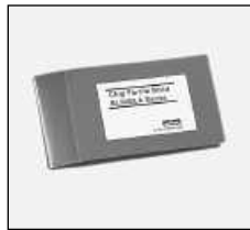
B. 8x4x1 Blue Binder with Sleeves