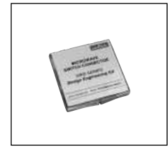
E. 4-3/4x4-3/4x3/4 Hard Plastic Box