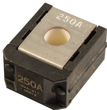
ZCASE Single Mega/Starter Fuse