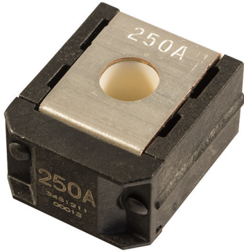
ZCASE Single Mega/Starter Fuse