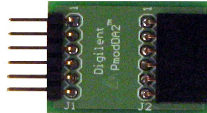
Figure 1 Digilent PmodDA2

The PmodDA2 is designed to work with either Digilent programmable logic system boards or embedded control system boards. Most Digilent system boards, such as the Nexys, Basys, or Cerebot, have 6-pin