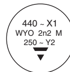
WYO 1 nF to 2.5 nF