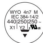
WYO 3.3 nF to 12 nF

All approval marks are also shown on the label.