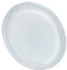
MSM Cover Protection cover for MSM 19 and MSM 22