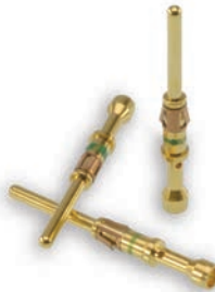
Size 16 AWG, No Insulation Grip