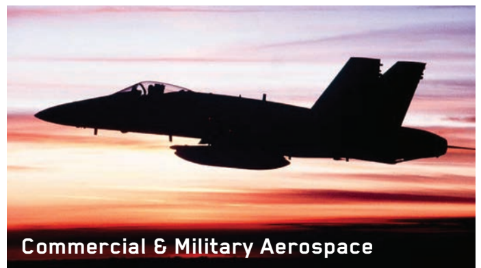
Commercial & Military Aerospace

Our connector portfolio remains the most extensive in the industry.