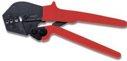
Ratcheted Hand Tool

A range of single action, factory calibrated tools are available to support the stamped contacts and 30 A power contacts.