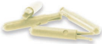
Discriminating Pin Insertion