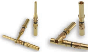
Size 16 AWG, No Insulation Grip