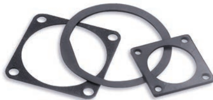
Jam Nut Type