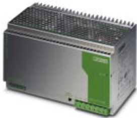
DIN rail power supply unit 24 V DC/40 A, primary switched-mode, 3-phase.

Please be informed that the data shown in this PDF Document is generated from our Online Catalog. Please find the complete data in the user's documentation. Our General Terms of Use for Downloads are valid ( http://phoenixcontact.com/download )