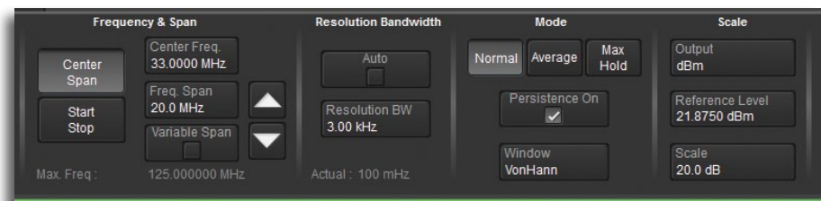
Spectrum analyzer style controls simplify waveform analysis in the frequency domain.

Get better insight to the frequency content of any signal with use of the Spectrum Analyzer mode on the HDO4000. This mode provides a spectrum analyzer style user interface with controls for start/stop frequency or center frequency and span. The resolution bandwidth is automatically set for best analysis or can be manually selected. Vertical Scale can be selected as dBm, dBV, dBmV, dBuV, Vrms or Arms for proper viewing and analysis while the unique peak search automatically labels spectral components and presents frequency and level in an interactive table. Utilize up to 20 markers to automatically identify harmonics and quickly analyze frequency content by making measurements between reference and delta markers. To monitor how the spectrum changes over time, view the spectrogram which can display a 2D or 3D history of the frequency content.