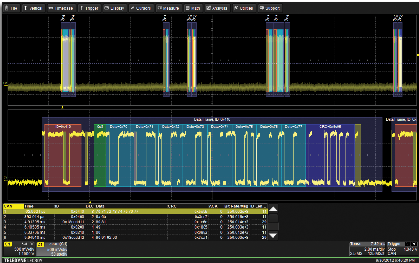
View decoded protocol information on top of physical layer waveforms and trigger on protocol specific messages.