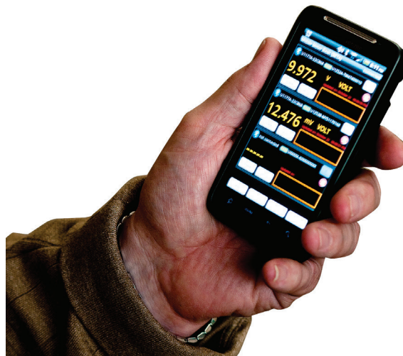
Figure 6. Make measurements with the Keysight Mobile Meter via an Android smart phone

Keysight Mobile Meter is a free Android application software that allows an Android device to connect, control and perform up to 3 multimeter measurements. Without the need to be physically present at various points, users can now extend their reach to two or three places. This solution allows you to make measurements from a safe distance, eliminates the need to walk back-and-forth between measure target and control points, and monitors multiple measurements simultaneously. Achieve higher work productivity when you use the U1177A with your Keysight handheld digital multimeters.