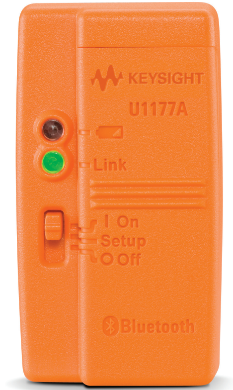
Figure 3. The U1177A as illustrated