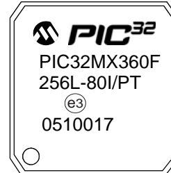
64-Lead QFN (9x9x0.9 mm)