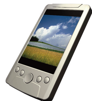
Compact consumer applications