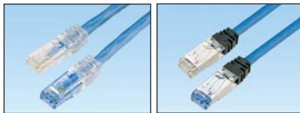
Keyed UTP Copper Patch Cords