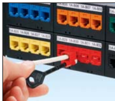
PSL-DCPLX, PSL-DCPLRX, and PSL-DCPLS