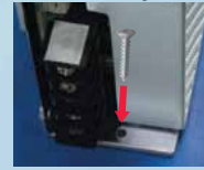
Screw Mounting from Top

Compact right-angle mounting bracket enclosed for easy mounting.