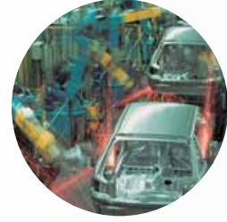
Vehicle manufacturing equipment