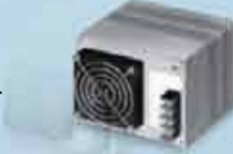
Standard Power Supply with Fan

Fan replacement every 2 to 3 years Dust drawn in by fan