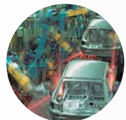
Vehicle manufacturing equipment