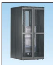
Net-Access™ 7018 Cabinets