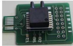
MS5701 (replaced by MS45xx)