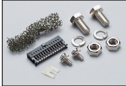
Model 2260-004: Accessory Kit (30V and 80V models): Air filter, analog connector cover, analog control lock lever, M8-size output terminal bolts, washers and screws, and M4-size output terminal screws with washers.