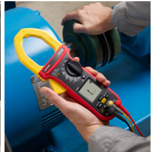
AMP-330 AC/DC 1000 A Clamp Meter Industrial Motor Maintenance