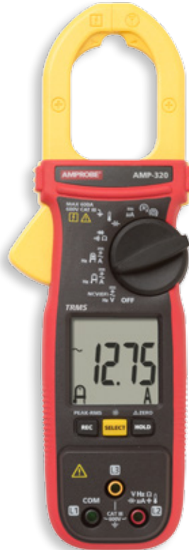
AMP-320 AC/DC Clamp Meter Electrical Motor Maintenance