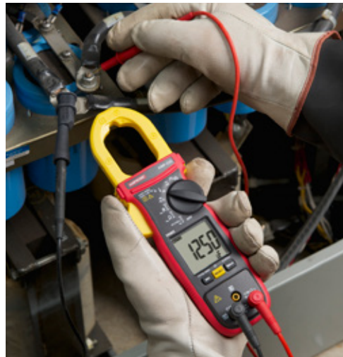
AMP-320 AC/DC Clamp Meter Electrical Motor Maintenance