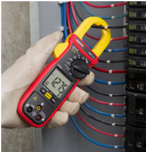
AMP-310 AC Clamp Meter HVAC