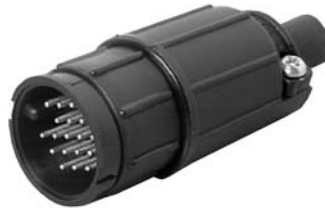
Cable to Cable 15X8X-XXXG-XXX Matching Mates: • Cable Pin 13X8X-XXPG-XXX • Cable Socket 13X8X-XXSG-XXX