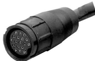
Cable to Cable