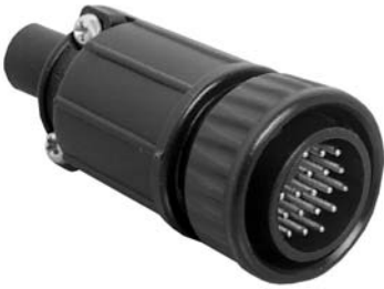
Cable Pin 13X8X-XXPG-XXX Matching Mates: • Cable-Cable 15X8X-XXSG-XXX • Panel 14XXX-XXSG-XXX