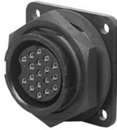
Panel Mount 14X8X-XXXG-XXX Matching Mates: • Cable Pin 13X8X-XXPG-XXX • Cable Socket 13X8X-XXSG-XXX