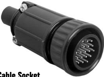
Cable Socket 13X8X-XXSG-XXX Matching Mates: • Cable-Cable 15X8X-XXPG-XXX • Panel 14XXX-XXPG-XXX