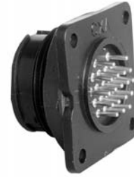
P/C Tail Panel Mount 14XXX-XXXG-XXX Matching Mates: • Cable Pin 13X8X-XXPG-XXX • Cable Socket 13X8X-XXSG-XXX