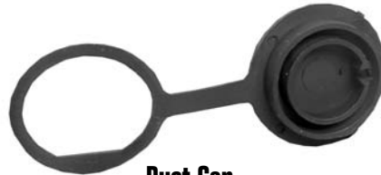
Dust Cap 14295