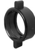
Winged Coupling Ring W/14482