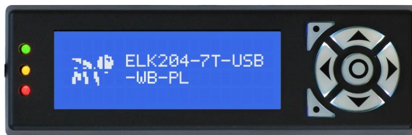
Figure 2: ELK204-7T-1U-PL