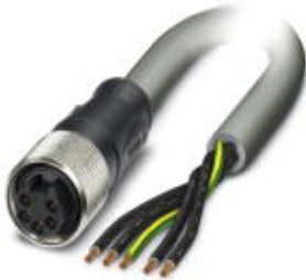
Power cable, 5-pos., gray PVC, 2.5 mm 2 , free cable end to straight 7/8" 16UNF socket, length: 10.0 m

Please be informed that the data shown in this PDF Document is generated from our Online Catalog. Please find the complete data in the user's documentation. Our General Terms of Use for Downloads are valid ( http://download.phoenixcontact.com )