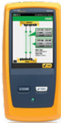
More on page 21