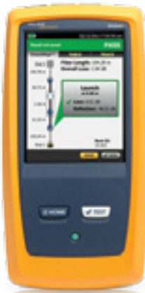
More on page 20