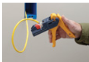
4. Ensure jack is completely and securely inserted in jack holder bed with IDC slots facing the blades.