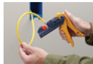
3. Insert jack in JackRapid front first with IDC slots facing blades of JackRapid.