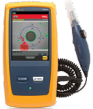
More on page 28