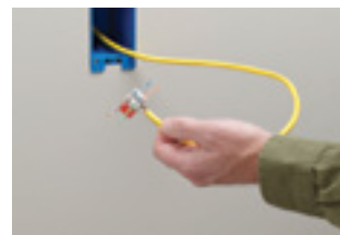
2. Determine wiring scheme. Dress all four pairs (eight wires).