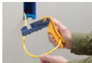
1. Strip cable jacket with a standard cable stripper or the built-in cable stripper.

Get accurate terminations and clean, consistent cuts every time with the JackRapid Termination Tool.