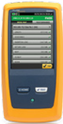
More on page 5

Faster systems acceptance for all copper and fiber certification jobs.