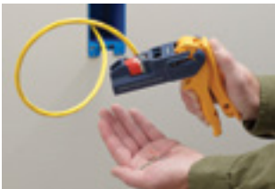
6. Wires will be seated and cut for a solid termination.