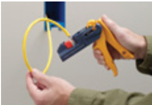
3. Insert jack in JackRapid front first with IDC slots facing blades of JackRapid.