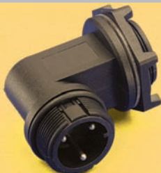
PX0803 - shown with insert