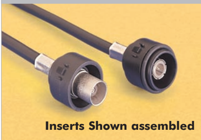
Inserts Shown assembled