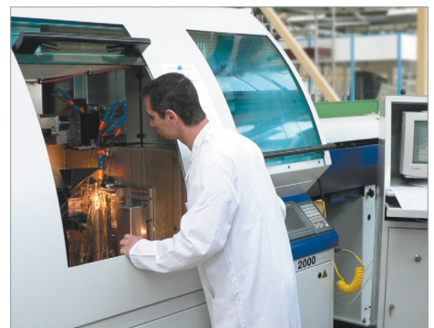
Technical information and sales contacts are available at www.radiall.com