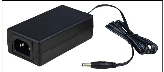
Figure 3. Universal power adapter included with the 19243 Mini Monitor

NOTE: The power cord must be purchased separately if ordering the 19243 Mini Monitor. The power cords are available as the following item numbers: