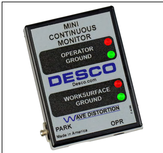
Figure 1. Desco Mini Monitor