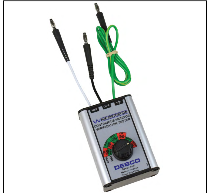
Figure 9. Desco 98221 Wave Distortion Monitor Verification Tester