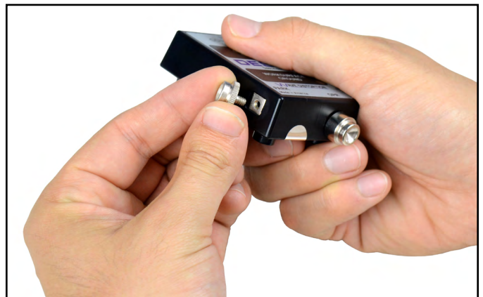
Figure 7. Changing the park snap on the 19243 Mini Monitor

The 19243 Mini Monitor includes an interchangeable 10mm park snap and 10mm banana jack adapter for operators who use wrist cords with 10mm terminations. Use the park snaps' knurled rims to unscrew the 4mm park snap from the monitor and install the 10mm park snap to the monitor. Plug the 10mm operator jack adapter into the monitor's operator jack.