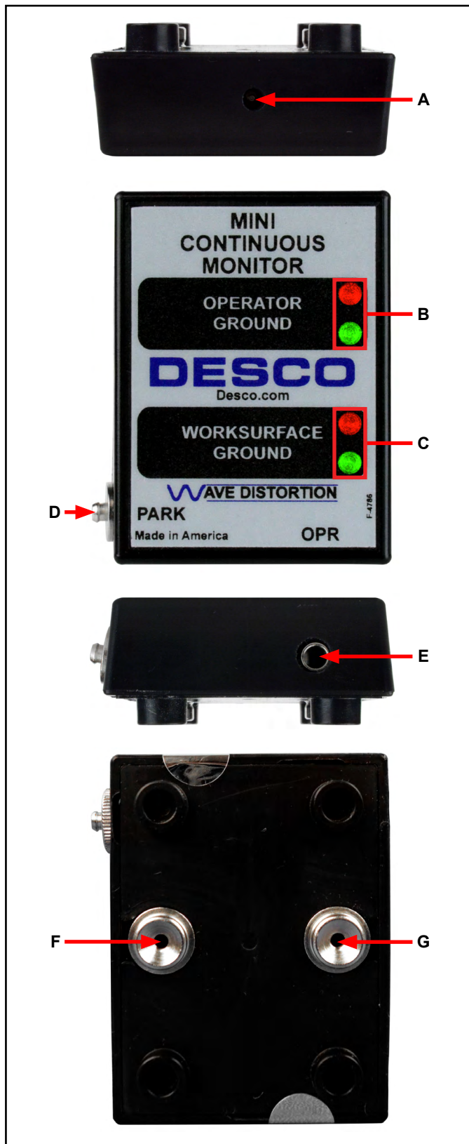
Figure 4. Mini Monitor features and components

A. Power Jack: Connect the included 24VDC power adapter here.