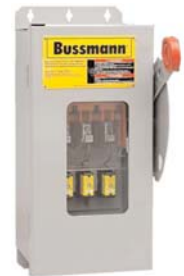
CF_ Quik-Spec™ Safety Switch disconnect (optional window). Data Sheet 1156

The only controlled copy of this Data Sheet is the electronic read-only version located on the Cooper Bussmann Network Drive. All other copies of this document are by definition uncontrolled. This bulletin is intended to clearly present comprehensive product data and provide technical information that will help the end user with design applications. Cooper Bussmann reserves the right, without notice, to change design or construction of any products and to discontinue or limit distribution of any products. Cooper Bussmann also reserves the right to change or update, without notice, any technical information contained in this bulletin. Once a product has been selected, it should be tested by the user in all possible applications.