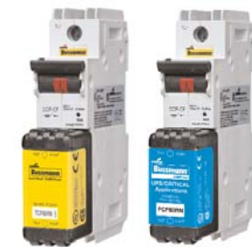
CCP_CF 1-, 2- & 3-Pole switched disconnects Data Sheet 1157