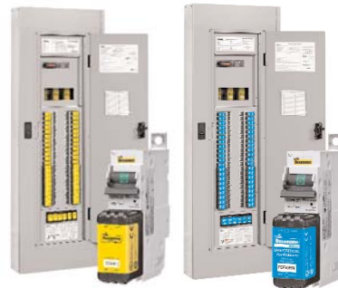
CCPB 1-, 2- & 3-Pole disconnects for the Quik-Spec™ Coordination Panelboard. Data Sheet 1160