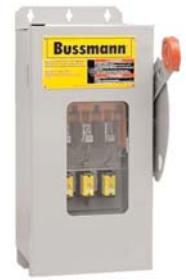
CF_ Quik-Spec™ Safety Switch disconnect (optional window). Data Sheet 1156

The only controlled copy of this Data Sheet is the electronic read-only version located on the Cooper Bussmann Network Drive. All other copies of this document are by definition uncontrolled. This bulletin is intended to clearly present comprehensive product data and provide technical information that will help the end user with design applications. Cooper Bussmann reserves the right, without notice, to change design or construction of any products and to discontinue or limit distribution of any products. Cooper Bussmann also reserves the right to change or update, without notice, any technical information contained in this bulletin. Once a product has been selected, it should be tested by the user in all possible applications.