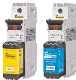
CCP_CF 1-, 2- & 3-Pole switched disconnects Data Sheet 1157