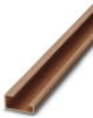
G-profile DIN rail, material: Copper, unperforated, height 15 mm, width 32 mm, length 2 m

DIN rail - NS 32 CU/35QMM UNPERF 2000MM - 1201358