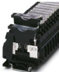
Fuse terminal block, cross section: 0.5 - 16 mm 2 , AWG: 18 - 8, width: 10.2 mm, color: blue

Please be informed that the data shown in this PDF Document is generated from our Online Catalog. Please find the complete data in the user's documentation. Our General Terms of Use for Downloads are valid ( http://download.phoenixcontact.com )