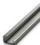
G-profile DIN rail, material: Steel, unperforated, height 15 mm, width 32 mm, length 2 m

DIN rail - NS 32 UNPERF 2000MM - 1201015