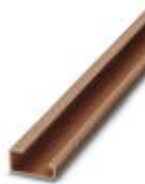
G-profile DIN rail, material: Copper, unperforated, height 15 mm, width 32 mm, length 2 m

DIN rail - NS 32 CU/35QMM UNPERF 2000MM - 1201358