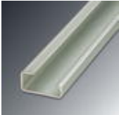
G rail 32 mm (NS 32)

DIN rail - NS 32 AL UNPERF 2000MM - 1201028