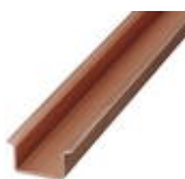
DIN rail, material: Copper, unperforated, 1.5 mm thick, height 15 mm, width 35 mm, length: 2 m

DIN rail - NS 35/15 CU UNPERF 2000MM - 1201895