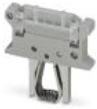
Isolating connector, for using the base fuse terminal block as plug disconnect terminal block