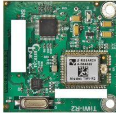
(1.7" x 1.8" – actual size)