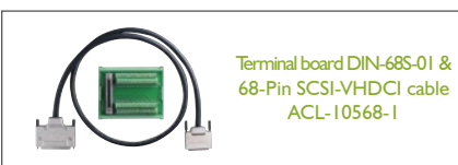
Terminal board DIN-68S-01 & 68-Pin SCSI-VHDCI cable ACL-10568-I