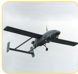
UAV Flight Control

The AHRS440 combines highly reliable MEMS sensors (gyros and accelerometers) with low noise magnetometers to provide accurate attitude and heading in a small and rugged environmentally-sealed enclosure. The AHRS440 provides consistent performance in challenging operating environments and is user-configurable for a wide variety of applications.