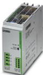
Primary-switched TRIO POWER power supply for DIN rail mounting, input: 3-phase, output: 24 V DC/10 A

Please be informed that the data shown in this PDF Document is generated from our Online Catalog. Please find the complete data in the user's documentation. Our General Terms of Use for Downloads are valid ( http://phoenixcontact.com/download )