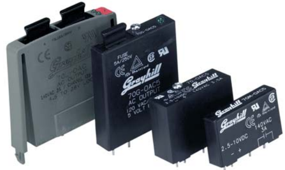
70L-OAC 70G-OAC 70-OAC 70M-OAC